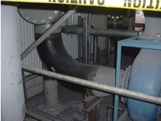
Fig. 4. Electric Power Plant Elbow and Pump

During installation of the pumps, it was determined that the indoor facility did not have adequate room for an upstream pipe run into the pumps. In Fig. 4. Electric Power Plant Elbow and Pump, note the close proximity of the building's wall to the elbow conditioner.