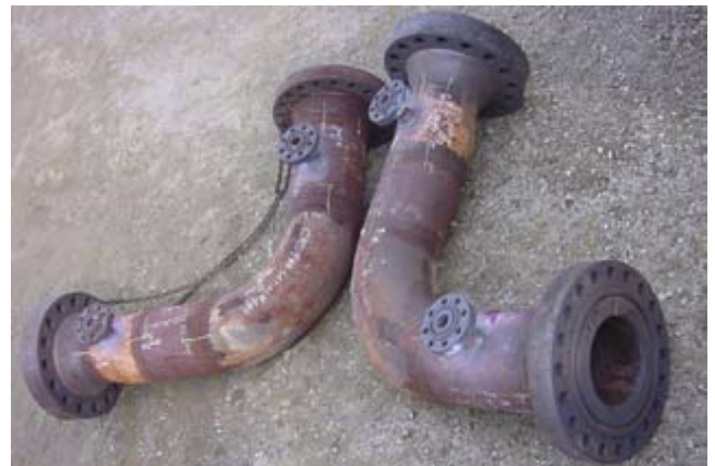
Fig. 3. Elbows for Offshore Oil Pumping Station

Tab type flow conditioners are suitable for application in many different processes. For example, at an offshore oil pumping station the process engineering team needed to add a pump to increase capacity. Elbows feeding into the pump consisted of a 20-inch inlet and reduced down to a 12-inch section.