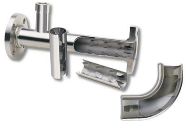
Fig. 2. Tube and Elbow Tab-Type Conditioner Cut-Away View

The standard straight tube Vortab® Flow Conditioner consists of pipe fitted with a short section of swirl reduction tabs combined with three arrays of profile conditioning tabs. The combination of anti-swirl and profile conditioning tabs creates a repeatable, flat velocity profile at the outlet of the pipe. This same tab-type flow conditioning technology also can be designed into an elbow flow conditioner (Fig 2).