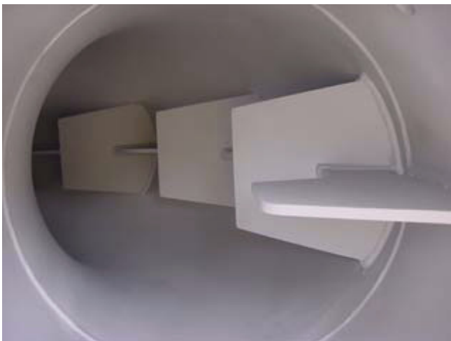
Fig.5. Elbow Flow Conditioner, Interior View

A natural gas producer faced a space limitation problem when retrofitting a pipeline pumping station with a new compressor (Fig 5). Achieving the proper upstream straight pump run required for the 3500 hp compressor would have necessitated the removal of existing underground pipe at substantial expense. Instead of digging their way out of this problem, a tab-type flow conditioner was plumbed directly into the compressor's inlet.